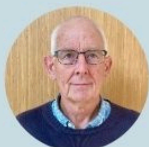
Rod Harding PCC