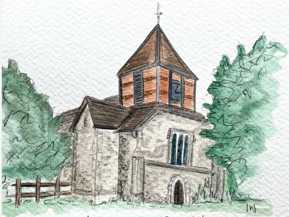
ALL SAINTS CHURCH MONK SHERBORNE