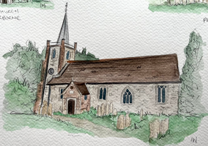
ST ANDREW'S CHURCH SHERBORNE ST JOHN