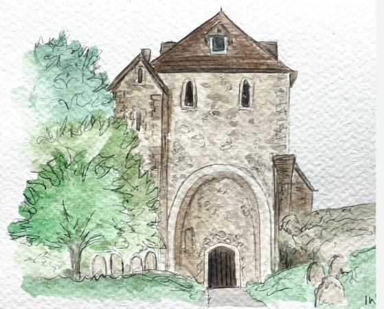
PAMBER PRIORY BASINGSTOKE